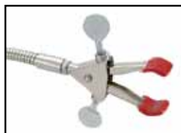
2-Prong Clamp Head