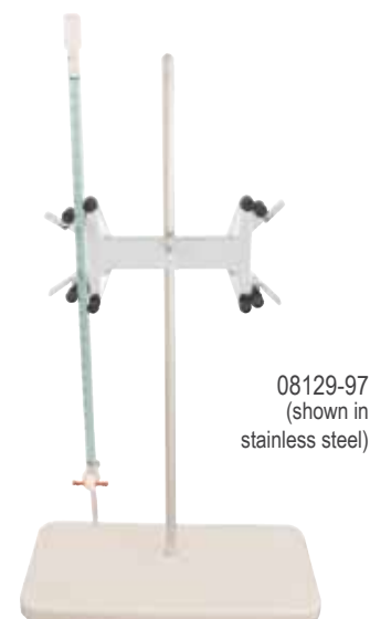
08129-97 (shown in stainless steel)