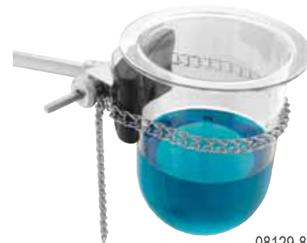
08129-89 (shown in stainless steel)