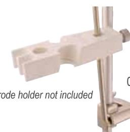
Electrode holder not included