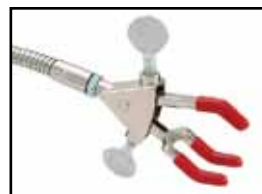
3-Prong Clamp Head