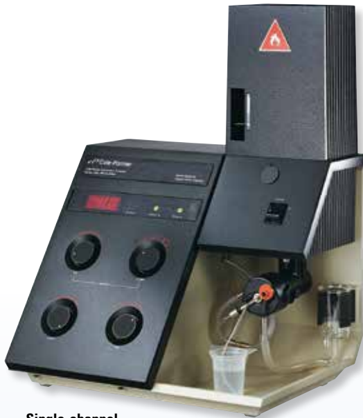
Single-channel flame photometer