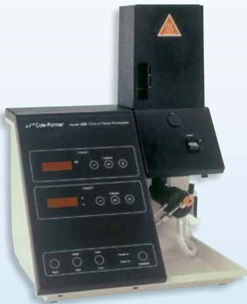
Dual-channel flame photometer