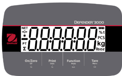
Figure 3 i-DT33P Control Panel