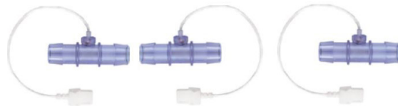
Connect up to 3 Pressure Sensors