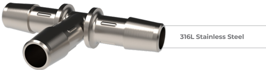
316L Stainless Steel

BN • GFBN • NK7 • NN • PP • PVDF • WN • WP QC MN • NK7 • PP