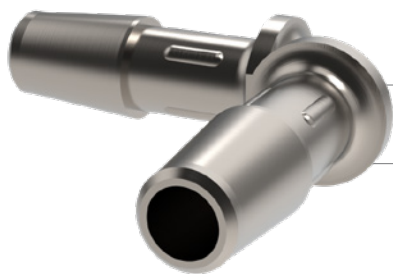
316L Stainless Steel

AC • BN • GFBN • NK7 • NN • PP • PVDF • WN • WP QC MN • NK7 • PP