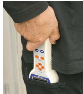
Small enough to fit a pocket