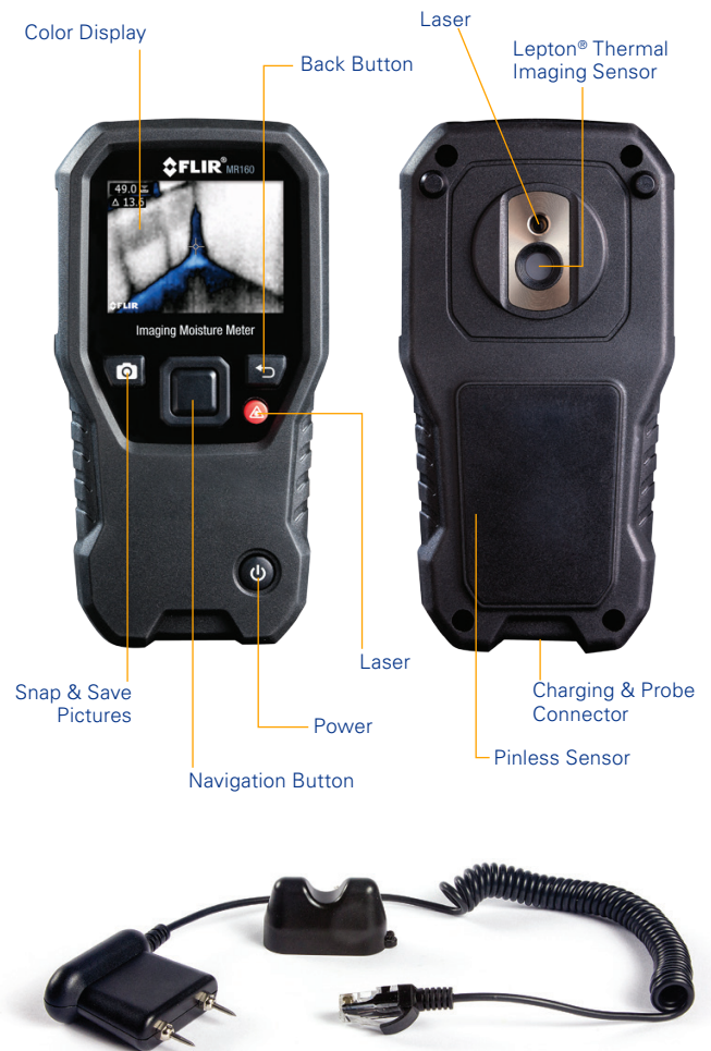
MR02 Pin Probe included

PORTLAND Corporate Headquarters FLIR Systems, Inc. 27700 SW Parkway Ave. Wilsonville, OR 97070 USA PH: +1 503.498.3547