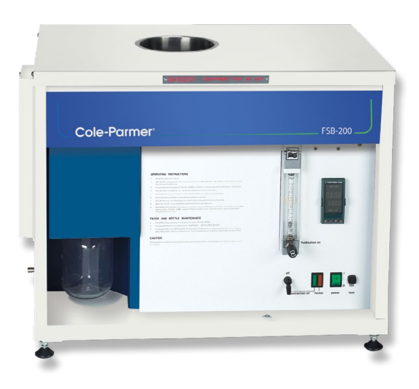
Precision Fluidized Bath FSB-200-P