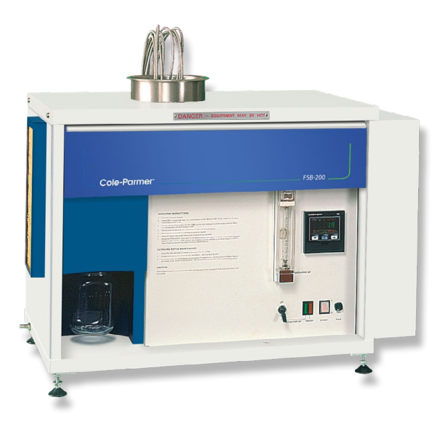
Precision Fluidized Bath FSB-200-P-AC