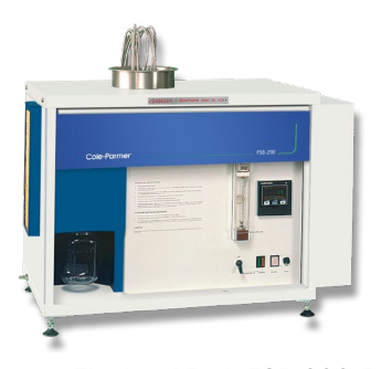
Precision Fluidized Bath FSB-200-P-AC