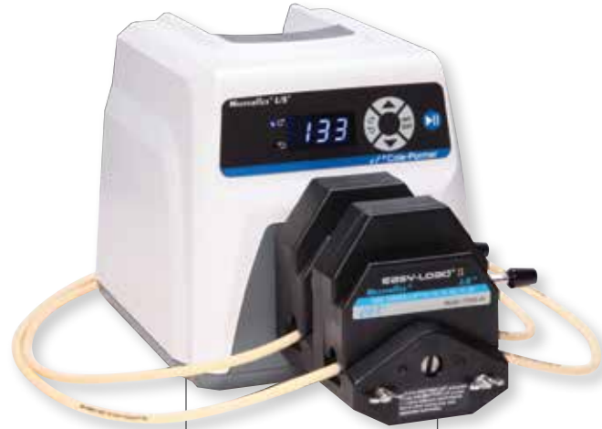
Stack up to 4 heads to maximize productivity in less space

Flow Rates in mL/min (flow rates in parentheses can only be obtained with the High-Performance pump head—see page 691)