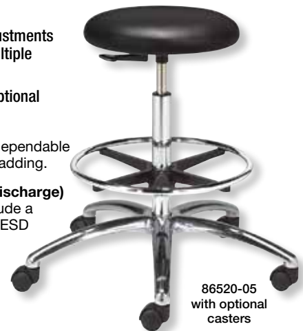
86520-05 with optional casters