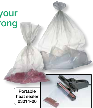
Portable heat sealer 03014-00