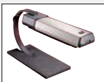
Optional lamp stand accommodates all models for hands-free operation.