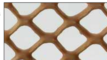
(Shown at actual size)