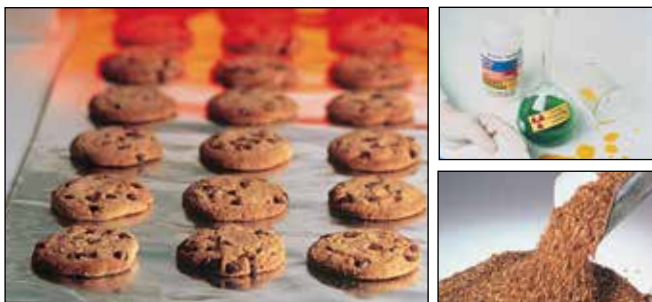
FEP-coated BYTAC is ideal for use in kitchens and laboratories.