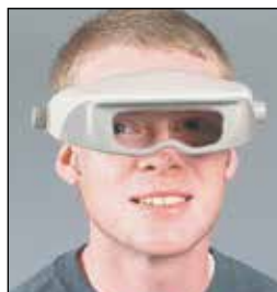
Visor tilts up when not in use.