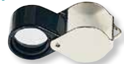
Swing-away case also serves as a handle.