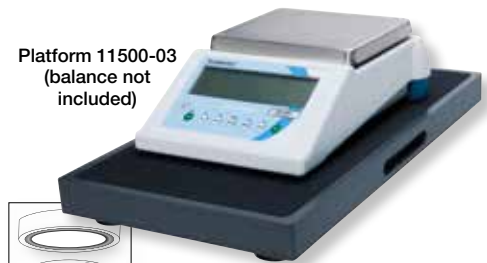
Platform 11500-03 (balance not included)

Lightweight and easy to set up, the platform isolates balances and other sensitive instruments and equipment from vibrations, and mechanical shock—ideal for balances, petri dishes, and shakers. Sturdy, gray PVC platform features a non-stick neoprene surface supported by three or four vibration isolation bearings, protecting balances and sensitive equipment from ambient vibrations and mechanical shocks.