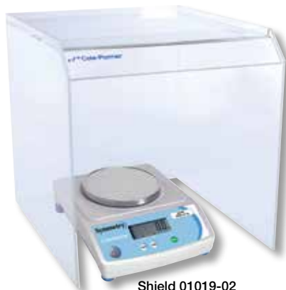
Shield 01019-02 (balance not included)