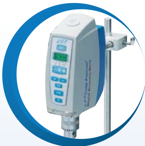
Digital Reversing Mixer with easy-to-read digital display and programmable settings

These Cole-Parmer® mixer systems offer uniquely advanced features, including programmable functionality and a remote control keypad option unlike any in the industry. These robust units will handle the most demanding laboratory mixing applications within the chemical, food, pharmaceutical and life science markets. They provide continuous, reliable operation, with accurate, repeatable results.