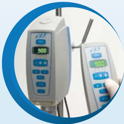
Modular Digital Reversing Mixer with dual keypad functionality and unique remote control